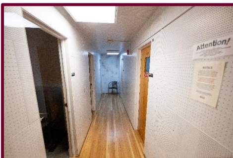
Practice rooms are too small.