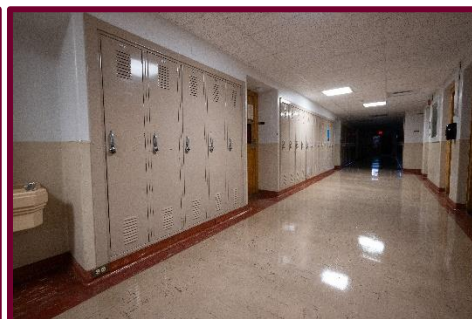
Storage lockers are broken and small.