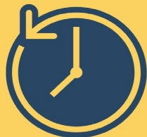
TIME TO COMPLETION