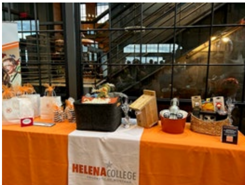
Figure 7 Donation Table Prizes