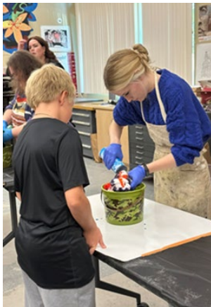
Figure 2 Tie-dying in the Classroom

The entire Bryant Elementary School paraded through Helena College to show off their Halloween costumes and collected some candy on Halloween.