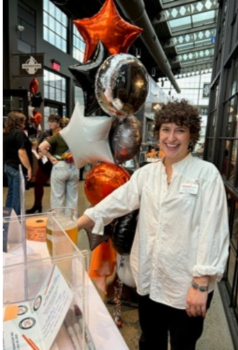
Figure 6 Alumni Event