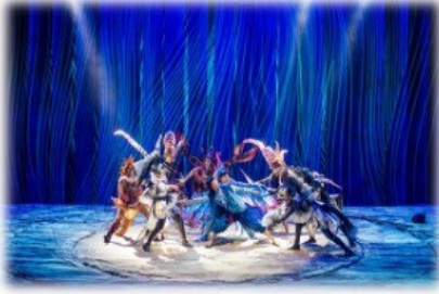
Figure 11 Sea Creatures