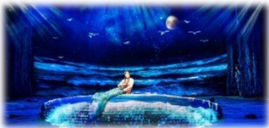
Figure 9 Chinese Mermaid on Stage (Actress is a High School Student from Montana)

https://drive.google.com/file/d/13Wtz5cxyKRuLrZWYKYE-1w2B8hoDKG-C/view?usp=sharing