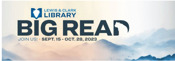
Figure 5 Big Read Logo

Overview: Wild nature fills the mythology of the American West. But is the wild disappearing? Despite this common fear, the restoration of animals like grizzly bears, bison, and wolves means that, in some contexts, Montana's wild nature may be starting to increase again. Nature, it turns out, may be on the point of being renewed. Christopher Preston looks at how these examples of renewal fit with the traditional account of nature preservation and what they might mean for how we think about the surrounding landscape going forward.