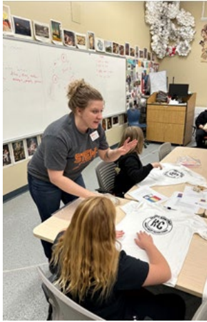
Figure 1 Shirt Preparation

In October our Bryant Elementary 5th graders/honorary Helena College students were on campus for their art class to tie-dye t-shirts. Check out the KTVH coverage ( https://www.ktvh.com/news/fifth-graders-go-to-college-to-pursue-art ) and the photos below.