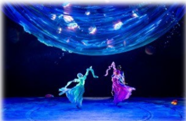
Figure 10 Figure on Stage in Costume