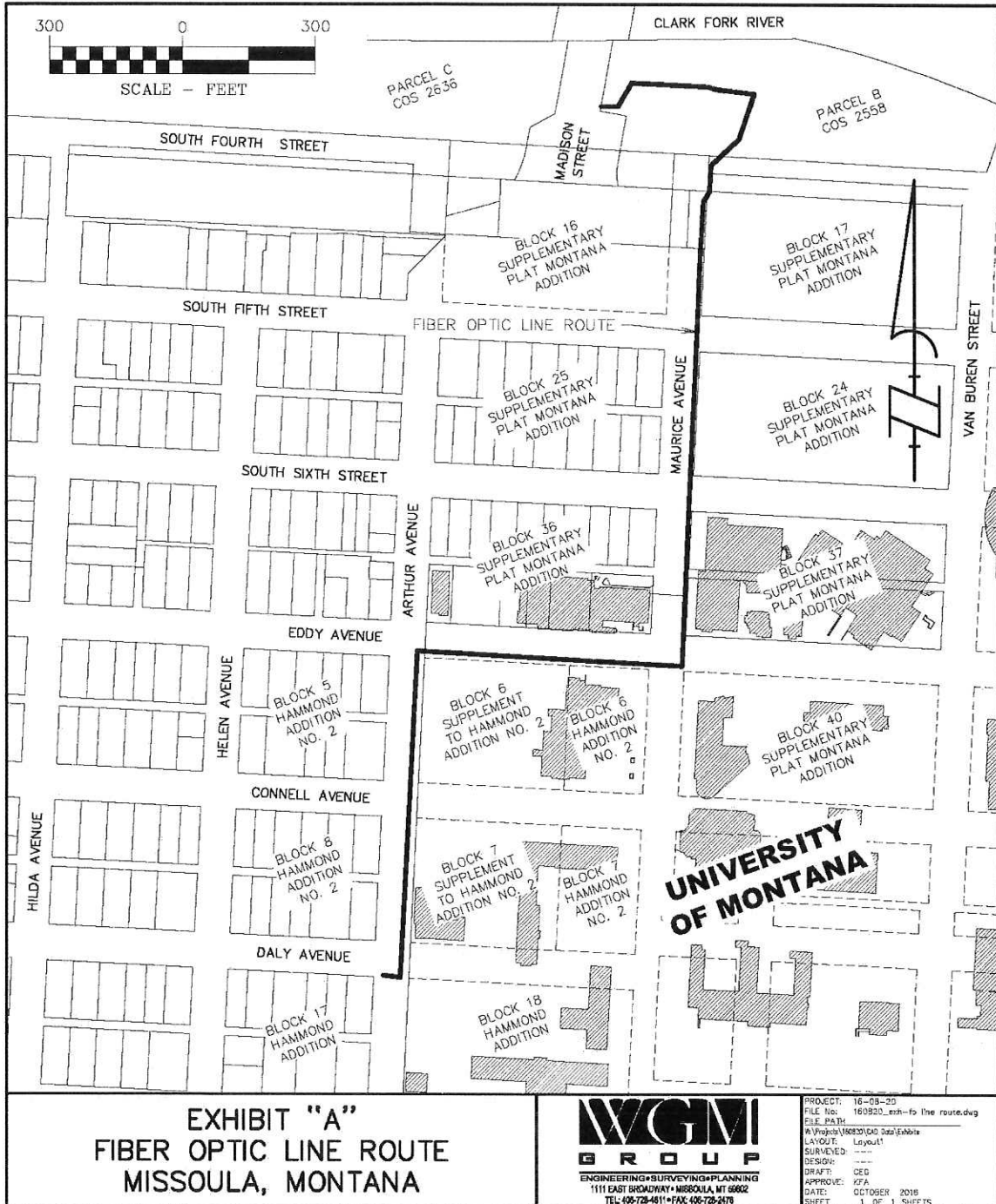
EXHIBIT "A" FIBER OPTIC LINE ROUTE MISSOULA, MONTANA

WGM GROUP ENGINEERING SURVEYING PLANNING 1111 EAST BROADWAY • MISSOULA, MT 59802 TEL: 406-728-4811 • FAX: 406-728-2478